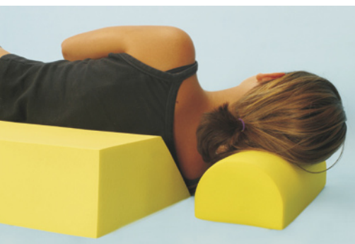
Foam4Care - side storage using Duren Mediline parts.

With major investments in the coming year, we are already well-equipped for the further expansion of our product range and well prepared for harder competition.