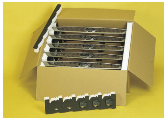
Packaging by Eurofoam Kremsmünster / Pactec - this packaging was awarded a nomination for the Austrian National Prize for Packaging.