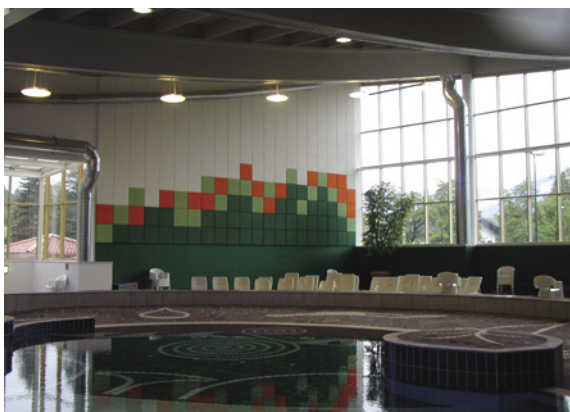
Indoor swimming pool, Eurofoam Linz / noise protection.