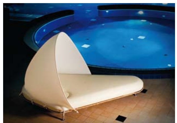
The new recliner seat by Joka comes with a positionable sail; the high lying comfort is ensured by foam made by Eurofoam.