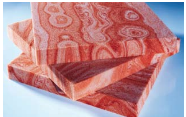
The Eurofoam deflammo FF® comfort foam of low flammability is used in numerous projects.