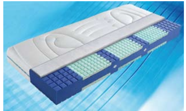
The specific EMC® sensitive comfort foam is equipped with antibacterial agents.