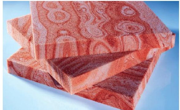
Eurofoam has expanded its deflammo FF range and now has three qualities with different densities on offer.