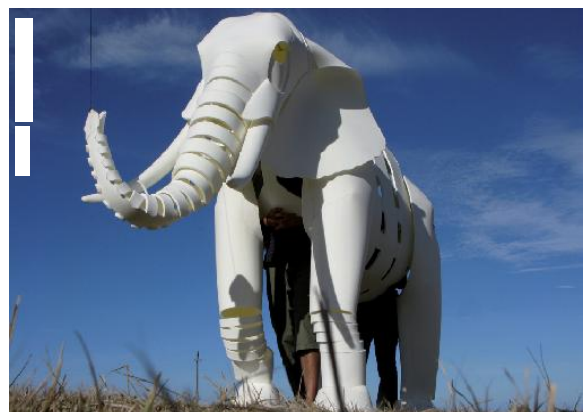
Foam meets art: More than 400 animals made from PE foam turned the "Linzer Klangwolke 2009" festival of music into a very special experience.