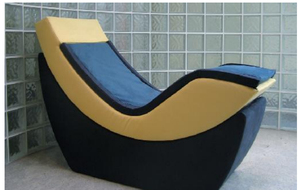
One of the first results of innovation management: the power-napping day bed for a refreshing nap over lunchtime.